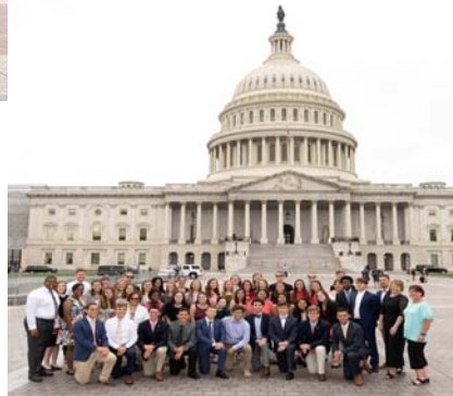
(Right: NC Youth Tourists)